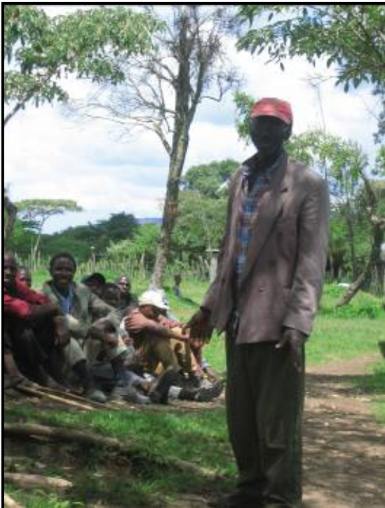
A community elder shares his views on the project.